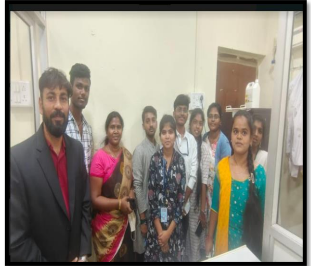
Department of Biochemistry, UCS, Osmania University, Hyderabad.