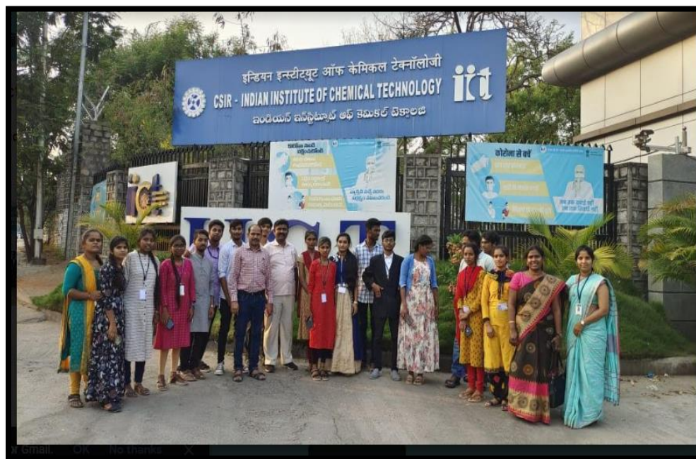
Field visit to IICT, Hyderabad on 30-06-2022