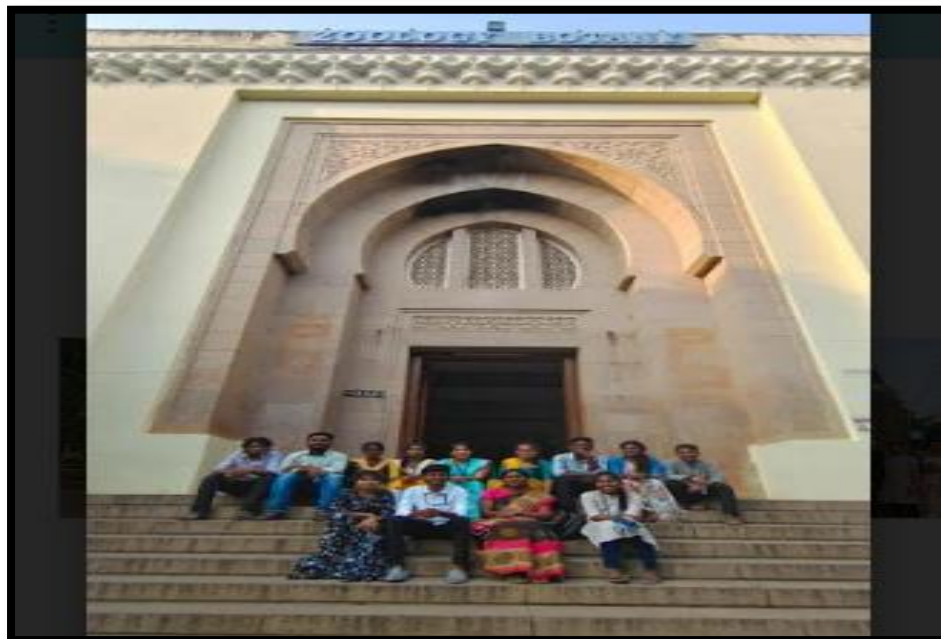
Field visit to osmania University on 30-06-2022,Hyderabad.